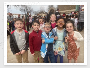
Brasser Bears getting ready to see Aladdin at RBTL